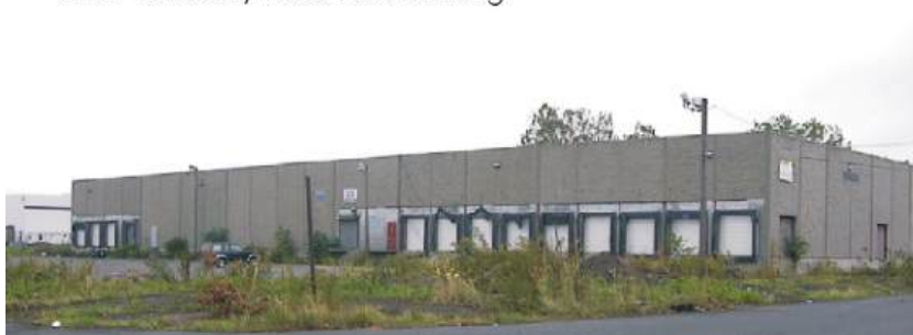
Making a real estate purchase takes a lot of legwork – I looked at 46 buildings and 23 pieces of land before I fell in love with this site in Jersey City

In 2000, I tackled a major challenge: relocating our company from a six-story Manhattan loft to New Jersey.